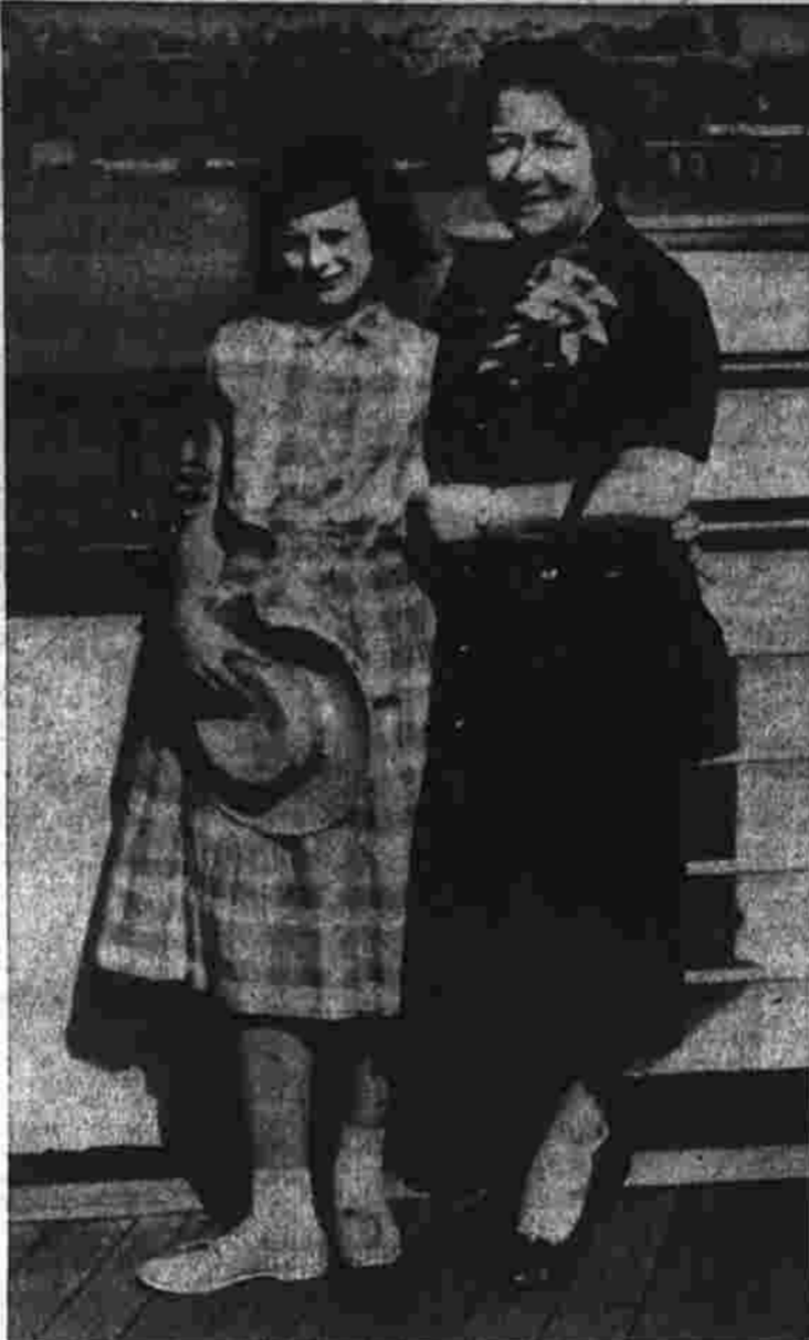
Nice Way to Spend Summer

It opposed the latter two proposals, and others since, on the basis of cost.